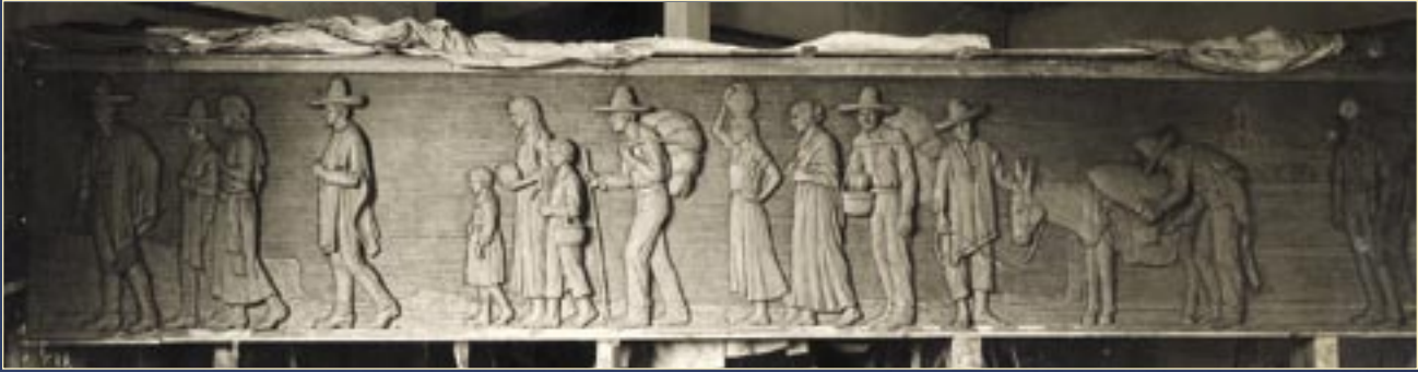
Arizona Temple relief 2