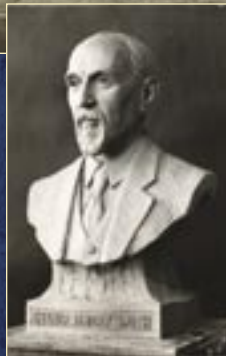
Bust of President Heber J. Grant