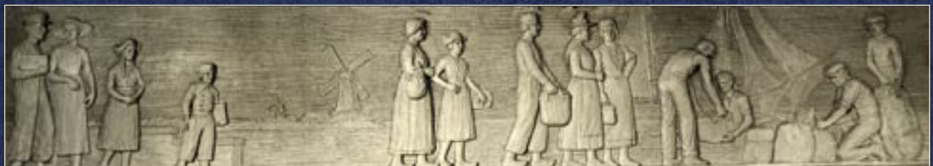
Arizona Temple relief 1