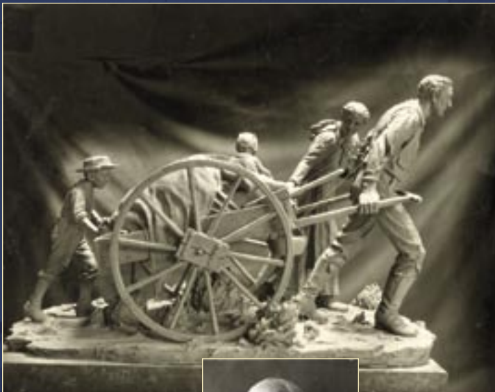
Handcart Pioneers statue on Temple Square