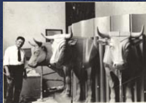
Oxen for baptismal font in the Oakland Temple