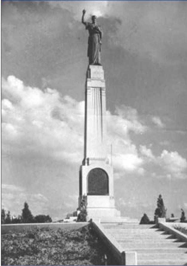
The Angel Moroni Monument is a tribute to Torleif Knaphus's faith and testimony as well as a testament of the Restoration.

summer glow over the beautiful landscape. The pale full moon had just risen in the eastern sky, giving a beautiful contrast to the warm floating clouds.” 24 The next day the decision was made to place the monument so that the gold-leafed bronze statue would face north toward the Sacred Grove and the Smith family farm. It would also be facing what was then the Canandaigua Road. In 1934 the hill was fairly devoid of trees. By the time the monument