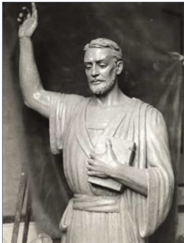
The statue of the angel Moroni near completion.