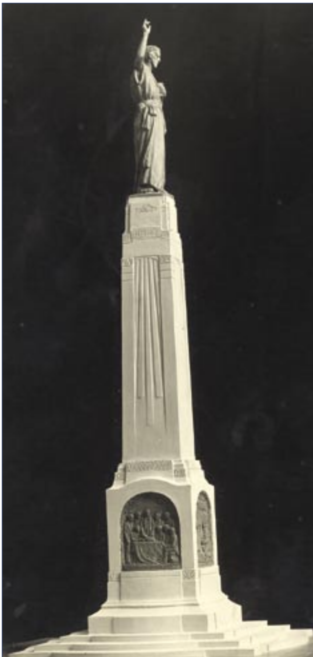
The monument's rich symbolism is elegantly subdued yet deeply meaningful.