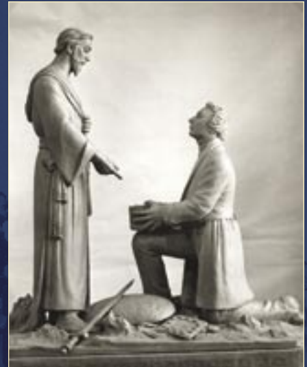
Joseph Receiving the Plates from the Angel Moroni Monument